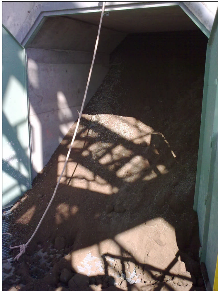
Figure 4: Minutes after shooting several charges at once at the bottom of the gossan wall, a large amount of ore collapsed into the feeder and overflowing through the side door

Few minutes after firing this larger round of 8 charges, several tonnes of gossan fell on the feeder number 1, filled it and pushed through the door until it was full to the ceiling. Had any worker being there at that time, it would have been under a serious safety situation.