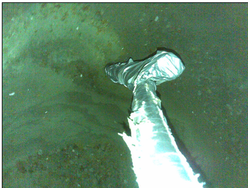
Figure 3: Once the cavity progressed upwards and into the silo, the only safe way to place the cartridges was attaching them to a long pole and inserting them in holes drilled with long compressed air spears.

In order to ensure safety, it was not allowed to place by hand at the face of the area to be blasted the cartridges. Instead, charges were placed at the end of poles which helped inserting them to the end of the holes from outside the silo. This was a slow, delicate maneuver, as it was easy to break electric cables and/or have the charge falling outside the hole.