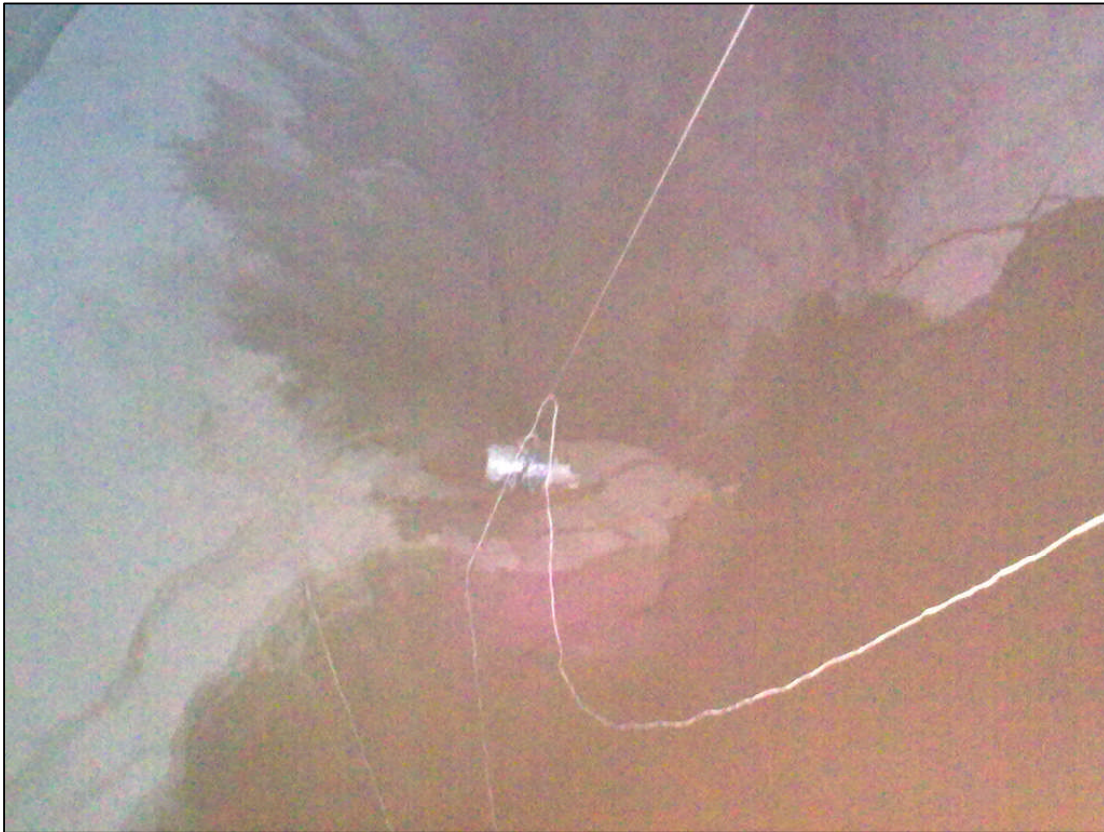
Figure 6: Placing the double charge on top of the crests created in between feeders. It was lowered with the help of a long rope. It had limited effect, although helped on collapsing part of the crest and, by air blast, shake the surrounding ore.