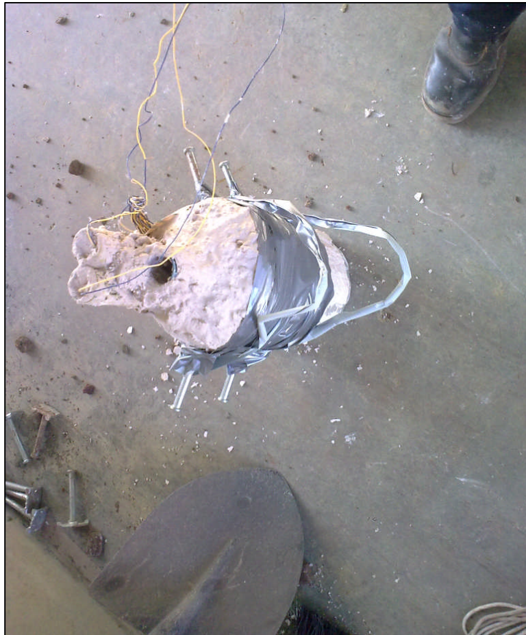
Figure 5: A self stemmed double charge was created to be placed on top of the ore. This had to have side stabilizers to prevent rollover and ensure downward actuation

Since there was no way to drill from the roof of the silo, a charge design that would direct the effect of the explosion downwards was created with hand ready items. This charge had to be self stemmed and stable in order to prevent rollover of it. The result of this design was two pyrotechnical charges on steel tubes on the side of a gypsum barrel.