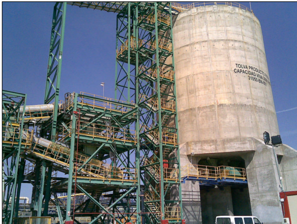
Figure 1: Fines silo of 3000 tonnes that contained wet, fine gossan ore that hardened due pressure and humidity, preventing flow at the feeders

Access to the silo was very limited, with only one gate at a side, and openings at the flat roof. Safety was a first priority, and first attempts to shake the material with the use of concrete vibrators or compressed air spears were unsuccessful. The wet, fine gossan material was hard enough to hold negative angles and high pressure air, and still plastic enough to withstand vibration without crumbling or flowing.